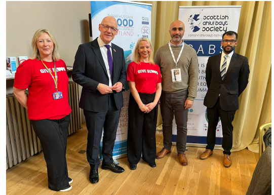
The First Minister of Scotland, John Swinney

Since the launch of the campaign, donation sessions have taken place in more than 19 cities across the UK.